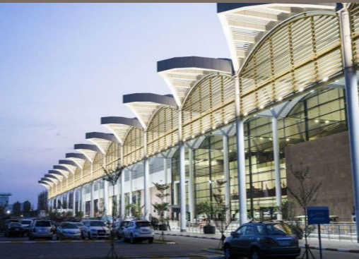
Phnom Penh International Airport (PNH)

ក្រសួងប្រៃសណីយ៍និងទូរគមនាគមន៍ MINISTRY OF POST AND TELECOMMUNICATIONS