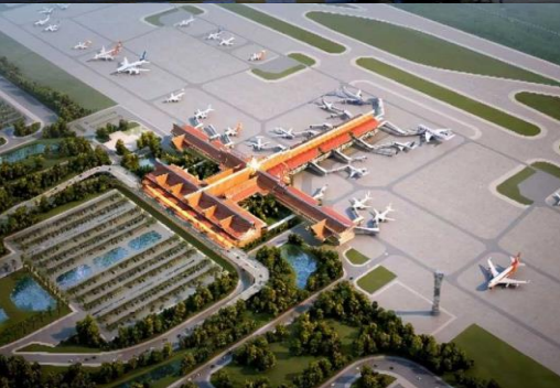
Siem Reap International Airport (REP)