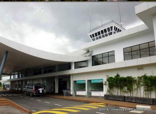
Sihanouk International Airport (KOS)