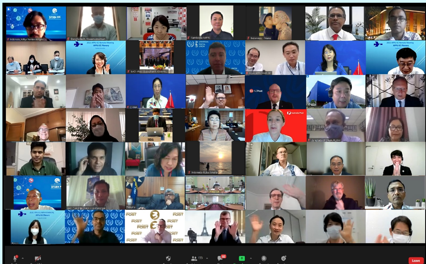
2021 APPU EC Plenary Meeting 20 July 2021