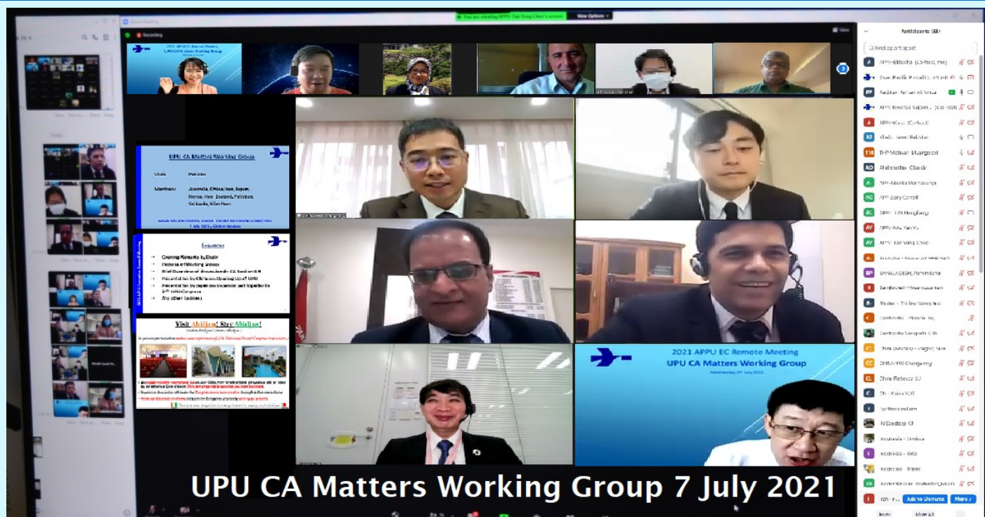
UPU CA Matters Working Group 7 July 2021